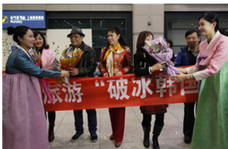
Chinese tourists go to South Korea