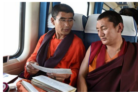
Tibetans take train home after pilgrimage or travelling