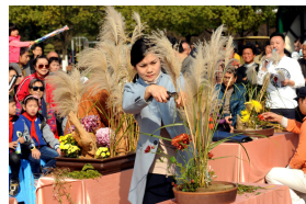
Reed Catkin Festival held in Wuhan