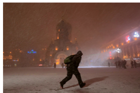
Snow turns Harbin into winter wonderland