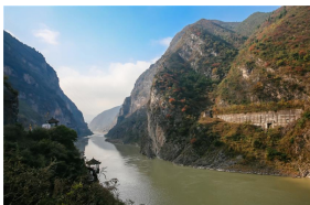
Ancient cities to be connected by Xi'an-Chengdu high-speed railway