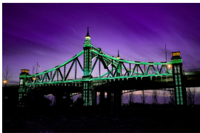
Night views of Harbin through the lens