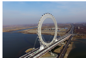
World's largest shaftless Ferris wheel built in China